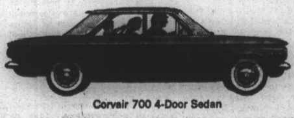
Corvair 700 4-Door Sedan

See your local authorized Chevrolet dealer for economical transportation