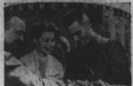
N. Y. YANKEE HOME RUN SLUGGER. That's Camel smoker, Roger Maris. He says he was a switch smoker - until he switched to Camels. They give him everything he wants, flavor, mildness and complete smoking satisfaction.

Are you smoking more now but enjoying it less?