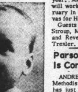
Ms. run for President? AS I want is a new Williambook. Freezed

The chartered bus will leave the Murphy bus terminal at 10:30 a.m., Saturday, and return to the terminal at 8:00 . . p.m.