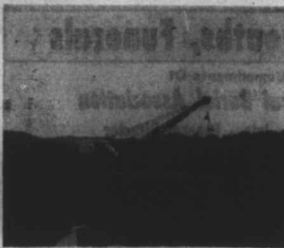
Dragline In Operation