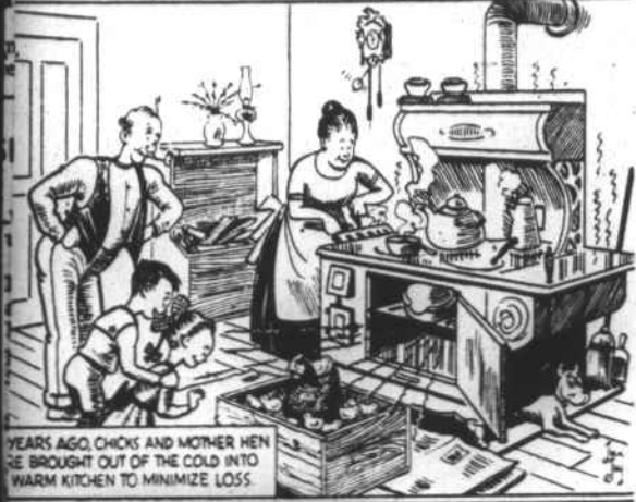
YEARS AGO CHICKS AND MOTHER HENS WERE BROUGHT OUT OF THE COLD INTO WARM KITCHENS TO MINIMIZE LOSS