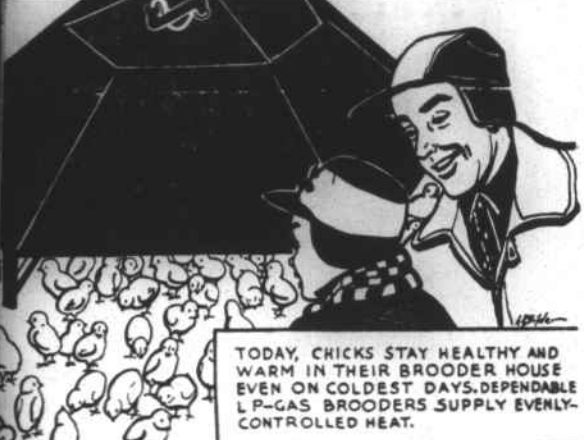
TODAY, CHICKS STAY HEALTHY AND WARM IN THEIR BROODER HOUSE EVEN ON COLDEST DAYS. DEPENDABLE LP-GAS BROODERS SUPPLY EVENLY-CONTROLLED HEAT.