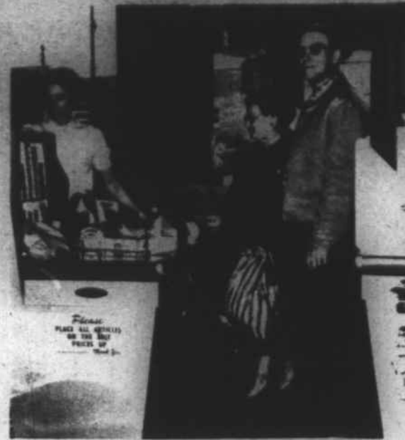
Howell's Modern Checkout Counter

Andrews - The PTSA will sponsor a dinner Sunday, March 26, from 2 p.m. until 2 p.m. at the school lunchroom. The menu will be baked ham, candied yams, lima beans, tossed salad, hot rolls, coffee, tea or milk. Choice of pie or cake. Tickets will be $1.50 for adults, $1.00 for ages 1-12 and proceeds will be used for new kitchen for lunch room. Everyone is urged to attend.