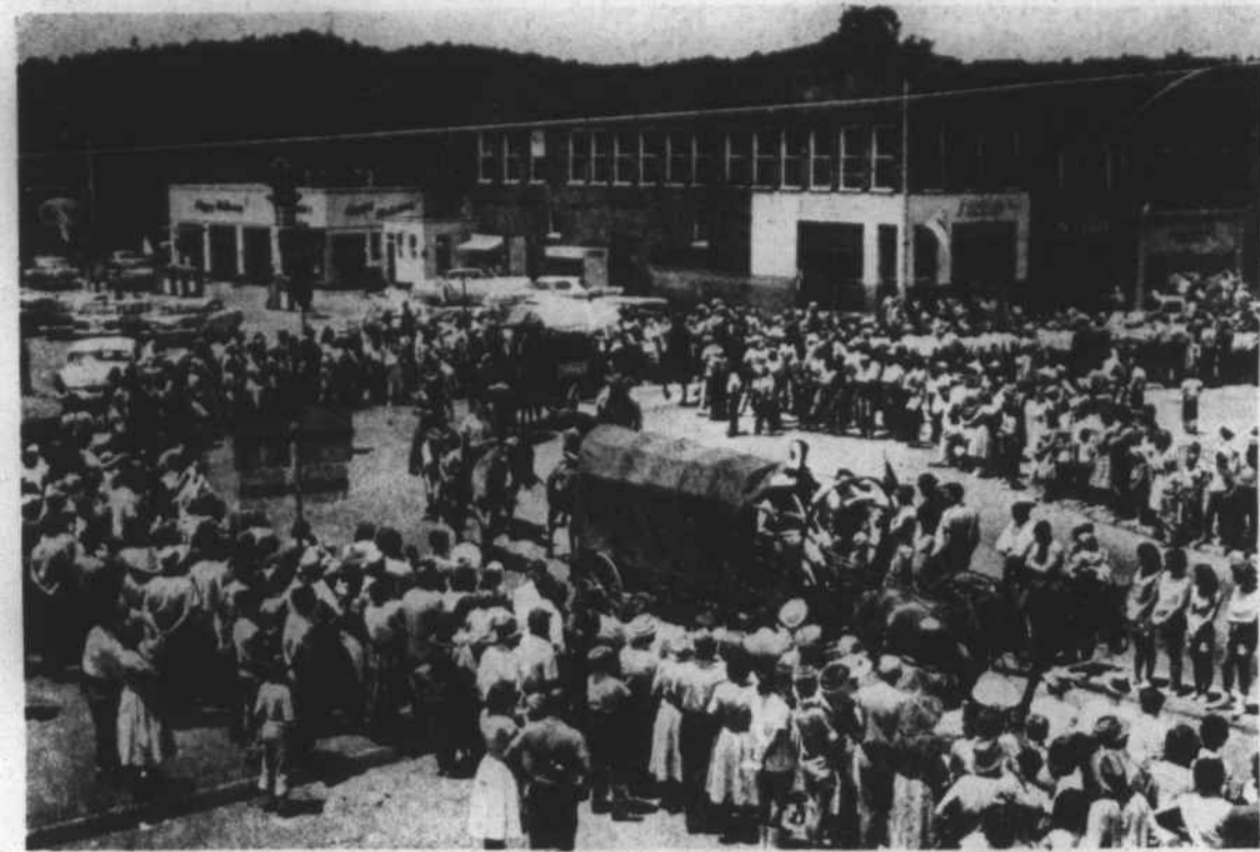
Over 80 Wagons And 400 Horseback Riders Rode Into Murphy