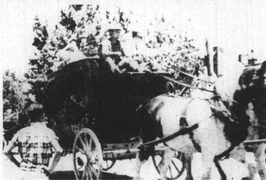
Stagecoach Carried Dignitaries