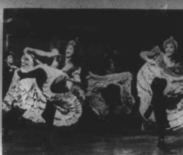
Julet Prowse and Shirley MaLaine head up the whirling and forbidden can-can chorus at the rowdy Bal Tabarin, in "Can-Can," 20th Century Fox CinemaScope Deluxe Color feature with Sinatra, Chevalier and Jourdan.