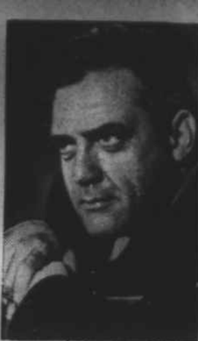
Raymond Burr, TV's Perry Mason is topcast in "Desire in the Dust," an AIP CinemaScope production released by Twentieth Century-Fox.