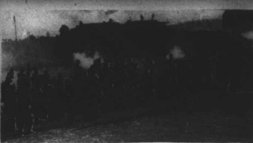
The first of Mexican dictator Santa Anna's 7,000 troops beg in to advance on the 185 defenders of "The Alamo" in this scene from John Wayne's $12,000,000 Technicolor production.