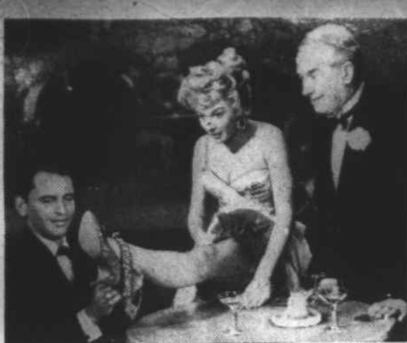
Sparkling Shirley MaLaine, who plays a cabaret-owner and can-can dancer in the gay Paree of the '90's displays her charms to her lawyer, Frank Sinatra, and a romantic judge, Maurice Chevalier, in a scene from "Can-Can", 20th Century-Fox CinemaScope Deluxe Color musical.