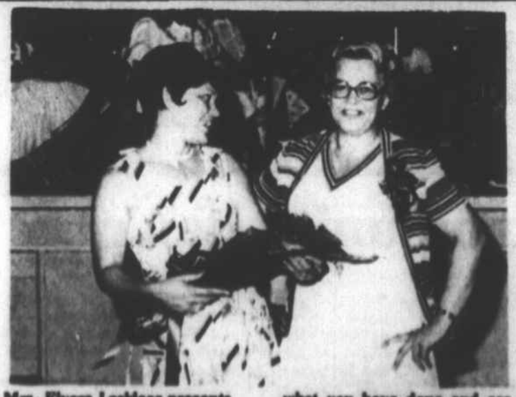
once' classes, "we approc