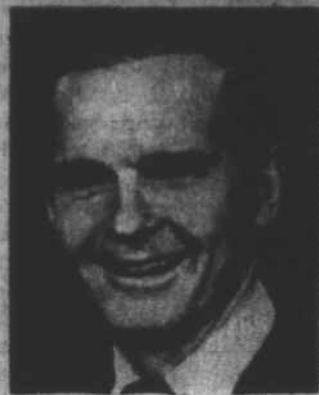
Sen. William Proxmire... speaks at PSU Saturday night at 8 p.m.

So, students, please get your financial aid applications in early!