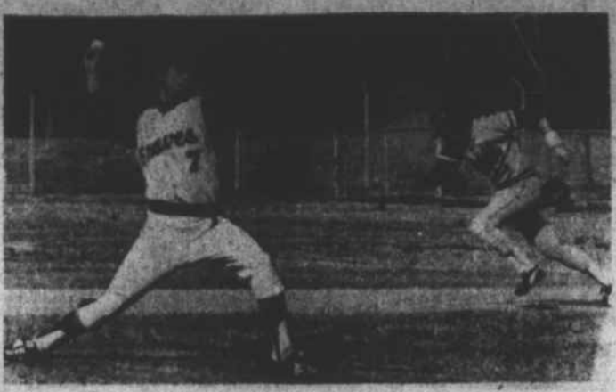
CATCH IT! PSU Baseball Fever is on and the Braves will be at home for only four more homegames. PSU hosts

Plans for next year include a cheerleading festival, an old-timers baseball and soccer game, a fun run, a band concert, the festival of arts, plus several other attractions. If you have any suggestions, send them into the Sports Information Office at Pembroke State.