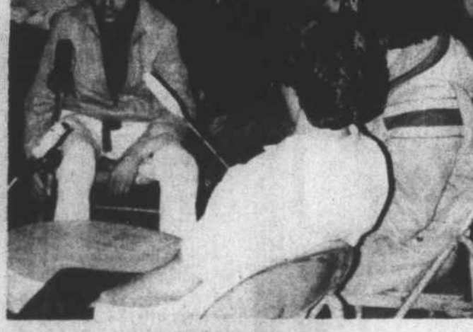
Youths are shown in rehearsal for the "Drumming and Sing-