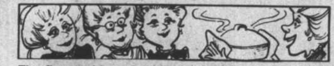
The first cooking school in the US was the New York Cooking School, which was opened in 1976 by Juliet Corson in her home.

She qualified for the state competition by winning first place in the Girls' Division of the "Help Them Hear" Oratorical Contest sponsored by the Evening Optimist Club of Wilson.