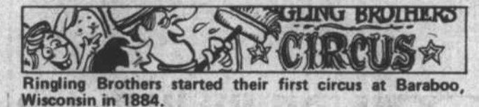
Ringling Brothers started their first circus at Baraboo, Wisconsin in 1884.