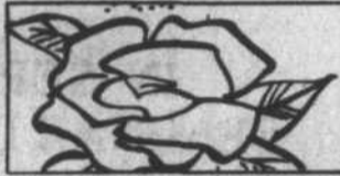
The gardenia was named after a Scottish naturalist, Alexander Garden.