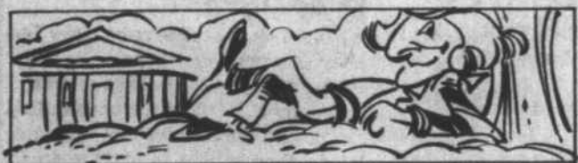
The first President to habitually wear long trousers was James Madison.

"Advice is like snow; the softer it falls, the longer it dwells upon, and the deeper it sinks into the mind." Samuel Taylor Coleridge