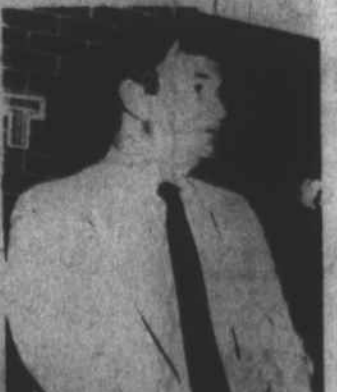
Congressman Charlie Rose, 7th Congressional District, was keynote speaker Thursday night at the Awards Banquet.