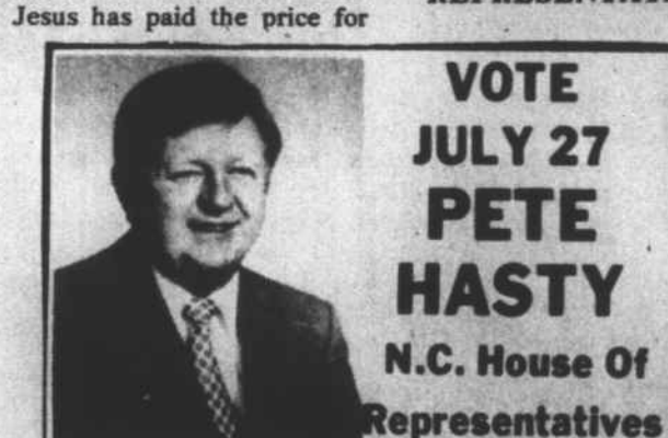
N.C. HOUSE of REPRESENTATIVES