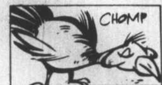
About half the meadowlark's diet is insects harmful to man, and the other half, weed seed.