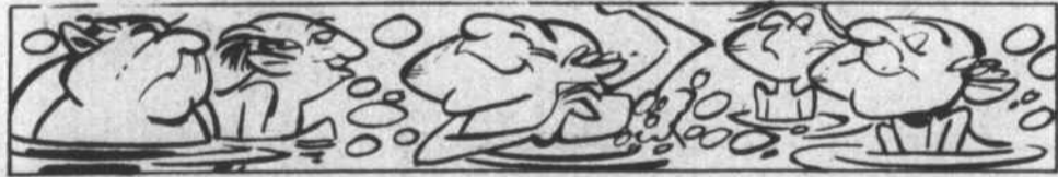
The Baths of Diocletian, the largest in ancient Rome, accommodated 3,000 people.