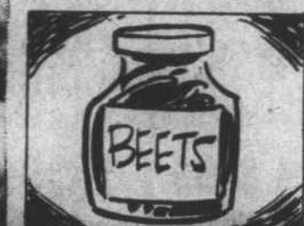
Beets are high in iron content. You can serve them hot with parsley butter and a little lemon juice or cold with a vinaigrette dressing.

"I believe that every human mind feels pleasure in doing good to another." Thomas Jefferson