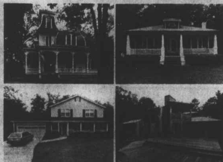
Savings based on houses with 1500 square feet. Bigger houses save more.

The way you build a home can make up to a 40% difference in what you pay for heating and cooling.