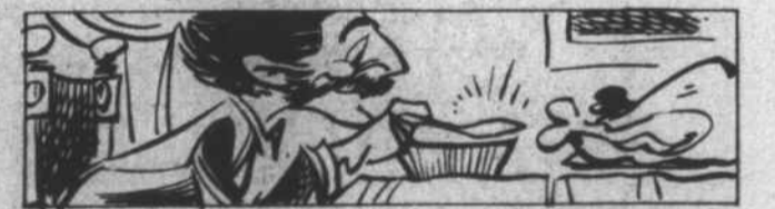
In Elizabethan England the spoon was such a novelty that people carried their own folding spoons to banquets.

"We cannot know where we are going if we do not know where we have been."