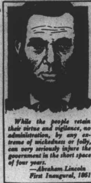
While the people retain their virtue and vigilance, no administration, by any extreme of wickedness or folly, can very seriously injure the government in the short space of four years. —Abraham Lincoln First Inaugural, 1861