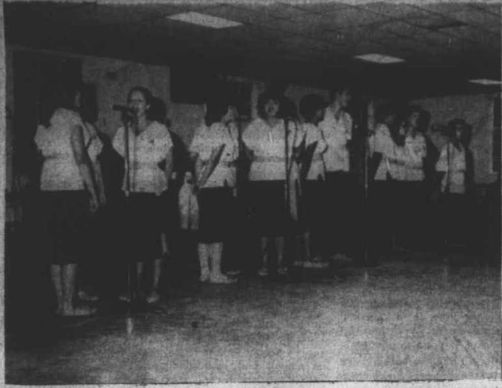
Lumbee Regional Development Association's Lumbee River Native American Center for the Arts Dancers and Singers will be performing at Robeson on Parade Nov. 5 at 8 p.m. at the PSU Performing Arts Center. The event is being sponsored by Strike at the Wind.