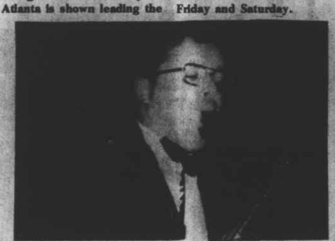
ring as a soloist with the PSU Concert Band and Jazz Ensemble last week. He has performed in Europe, Japan, Canada and the major music centers of America, including Carnegie Hall. He now serves as professor of saxophone Arts.