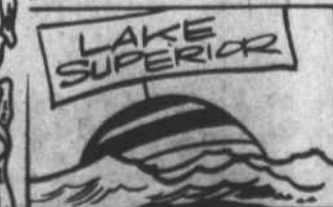
Lake Superior is our nation's largest lake with a total area of more than 31,000 square miles.