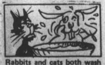
Rabbits and cats both wash their faces with their paws, but a rabbit uses both paws at once and the cat only uses one paw at a time.