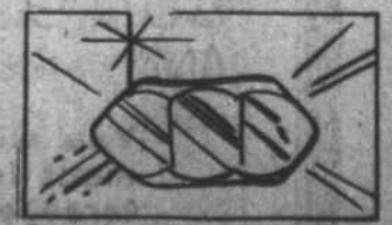
Stars in synthetic star sapphires and rubies appear sharper than natural stars.

Birthday Proverbs for Thursday, Dec. 2 1 Timothy 6:6 But Godliness with contentment is great gain.