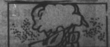
Ice-cream manufacturing began in the U.S. in 1851.