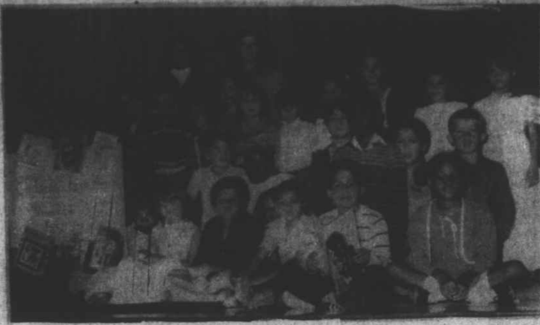
Book Week, November 15 to 21 was celebrated by the students of Deep Branch School with a gathering in the

school's auditorium for a performance by each class enacting how books play an important part in our lives.