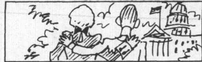
The first American coin bearing the portrait of a living President was the 1926 half dollar. It bore the heads of Presidents George Washington and Calvin Coolidge.