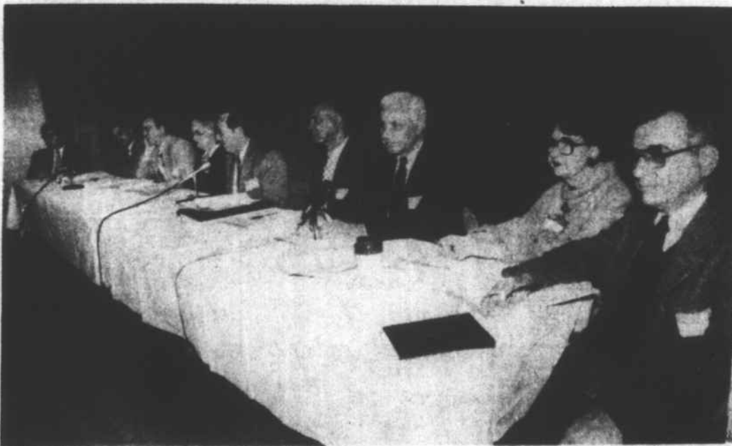
Members of PSU's Chancellor Search Committee listen to comments from the audience during a three-hour public meeting Monday night at PSU concerning qualifica-

comments to the PSU Chancellor Search Committee concerning qualifications needed in PSU's future chancellor to take office July 1, 1989.