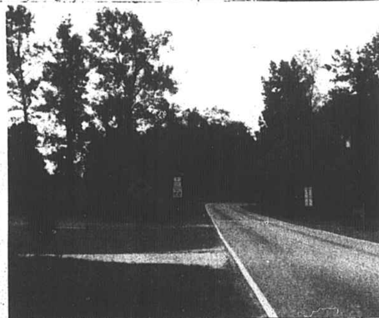
A contradiction in signs. One sign near the curve says 25 mph another says 55.