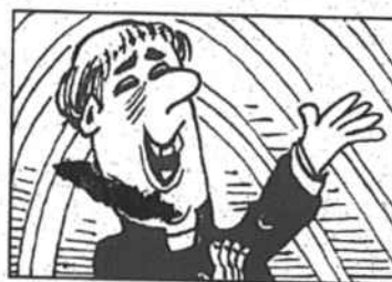
The music term a capella comes from the Italian, meaning "from the chapel."

Finally, the purpose of all these saying is to determine the true worth of our disciplined use of what we have learned and heard. For as it was said to the steward "Give me an accounting of your management because you cannot be my manager any longer."