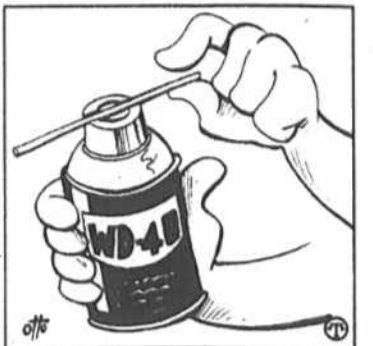
The last straw? Indeed. A new cap helps consumers keep track of the handy applicator.

(NAPS)—People who spend time in workshops, garages and warehouses know that being without that one essential tool or component needed to complete the job can be frustrating. One invaluable yet elusive tool—the little spray tube that comes with many aerosol cans—invariably gets lost in workshop nooks and crannies.