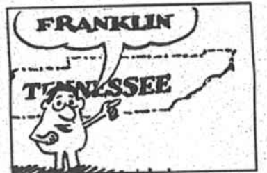
Until 1796, the state of Tennessee was called Franklin.