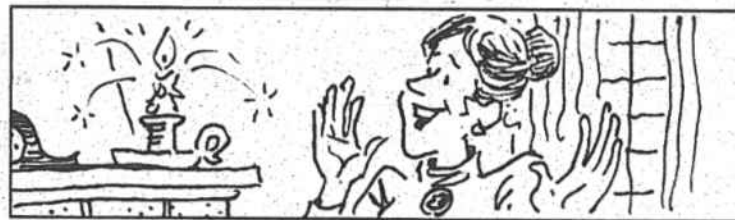
According to folklore, when a candle gives forth a spark, a letter is coming to the person sitting nearest it.

Microsoft's Stay Safe Online, at www.microsoft.com/presspass/youthandlearning . The American Zinc Association at www.zinc.org . The United States Postal Service Web site at www.usps.com . Pitney Bowes at www.pitneybowes.com . Microsoft Office at www.microsoft.com/office . The Office Update Web site is located at www.officeupdate.com . ARMOR All Cleaning, Protectant or Glass Wipe is found at www.armorall.com . Staples.com Business Services Center at www.staples.com/businesssolutions . The Spina Bifida Association of America at www.sbaa.org . QVC Publishing, Inc. at www.qvc.com . Flex-A-Min at www.flexamin.com .