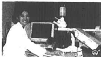
A new device that makes it easier to see and isolate specific cancer cells contributes to the diagnosis of cancer.

In response to the problem, Leica Microsystems has introduced a laser microdissection