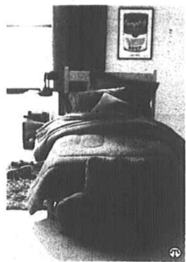
It's a smart idea for college students to make their dorm rooms as comfortable as possible.

• Keep clutter to a minimum —Storage containers can mean the difference between organizing your closet and living in one. Unlike a generation ago,