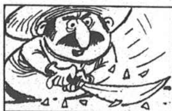
Mexican dollars, minted in 1790, could be chopped into eight pieces called bits, or into quarters, called two bits.