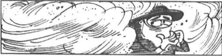
In 1934, great curtains of dust were carried across the continent from the "dust bowl" of Oklahoma to the Atlantic Coast.