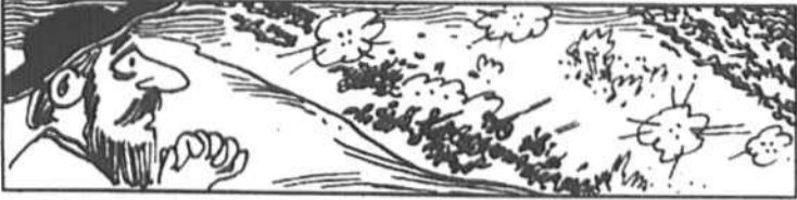
The International Red Cross was founded by Swiss banker Jean Henri Dunant in 1863 after he watched the battle of Solferino in 1859.