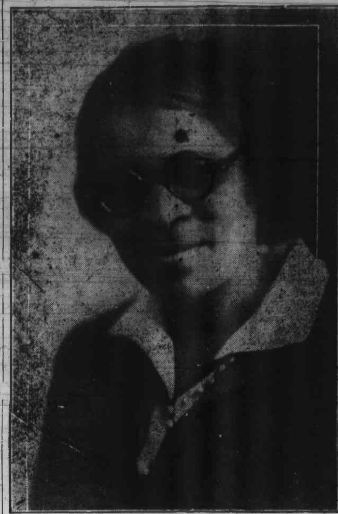
Dr. Charlotte Hawkins Brown, founder and president of Palmer Memorial Inst., witnessed the