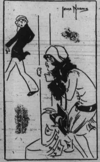
"A man may be lucky and still have Miss Fortune follow him."