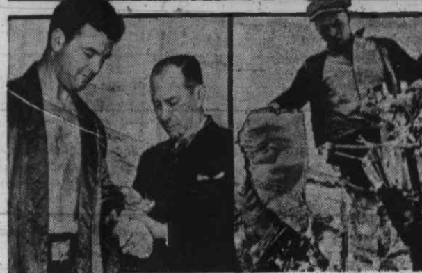
CHAMP IN FINE FETTLE—Heavyweight champion James Braddock gets the official medical stamp of approval on the eve of his fight with Joe Louis.