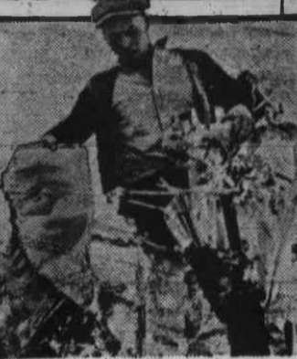
END OF THE SKY-TRAIL—The transport plane that disappeared completely near Salt Lake months ago was found smashed to small pieces when mountain snows melted. A searcher is holding some of the fragments, none of which were bigger than a washtub.