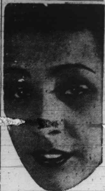
How to become