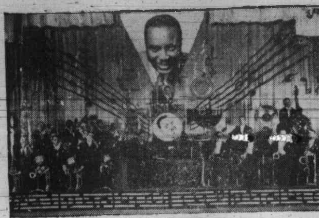
Jimmie Lunceford and his Master Musicians, the boys with the Streamline Rhythm who will appear at the New Armory Auditorium for the first colored dance in this building on August 13.