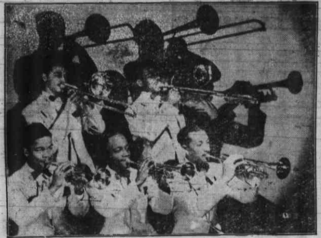
Above is a section of the Tiny Bradshaw orchestra which will appear at the New Armory in this city Friday October 29th to play for a Halloween dance sponsored by the Alumni Association of North Carolina College for Negroes.