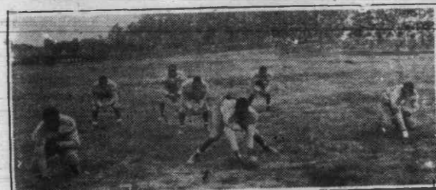
1937 EAGLES SQUAD AND THE COACHES

The Durham team will enter the fray with a string of three consecutive victories over the Shaw eleven and a season record of two victories and one tie. The Bears with two decisive victories over conference teams appear as well healed for a good season.