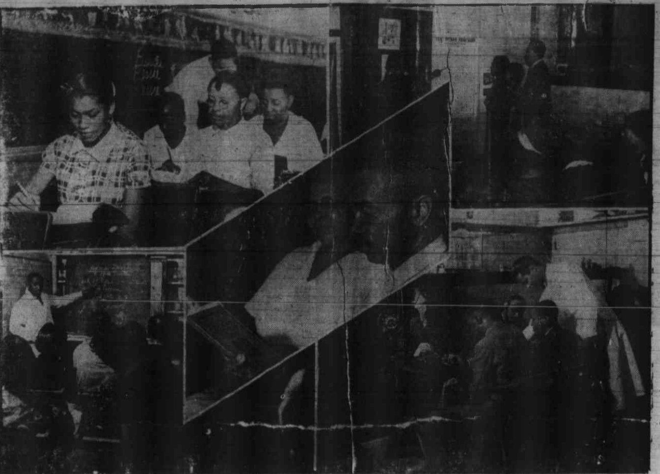
chemistry of cosmetics (lower left), and a class in radio mechanics (lower right). The inset above shows a student in a literacy class learning simple arithmetic with the aid of the teacher. WPA Photos

DENIED the privilege of public education in their youth by lack of facilities, apathy on the part of the public or ignorance on the part of their parents, over 350,000 colored men and women all over the country have in the past few years been going back to school—in leisure daytime hours, evenings after work, even late at night. Packing makeshift WPA study centers, they have seized eagerly upon opportunities for learning which before the start of the work-relief program did not exist. Their teachers, too, are benefiting through the program, as their work with the WPA keeps them in trim for a better teaching job. Shown above are an elementary class in reading and writing (upper left), a shorthand class (upper right), a class in the