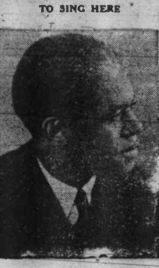
ROLAND HAYES, Celebrated Tenor who will be heard in a recital in the North Carolina College new auditorium Monday evening at eight o'clock. Indications already point to a sellout for the appearance of Mr. Hayes at the local institution.