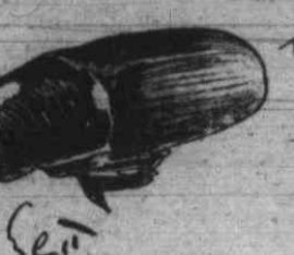
THE ELM BARK BEETLE (DUTCH ELM DISEASE CARRIER) IS FAST BRINGING THE ELM TO EXTINCTION IN THE UNITED STATES

Copyright, 1935, by Capitol Press Association, Inc. 7-13