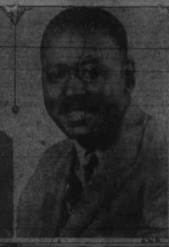
Both are widely known in Montgomery, where the bridegroom has a lucrative practice.