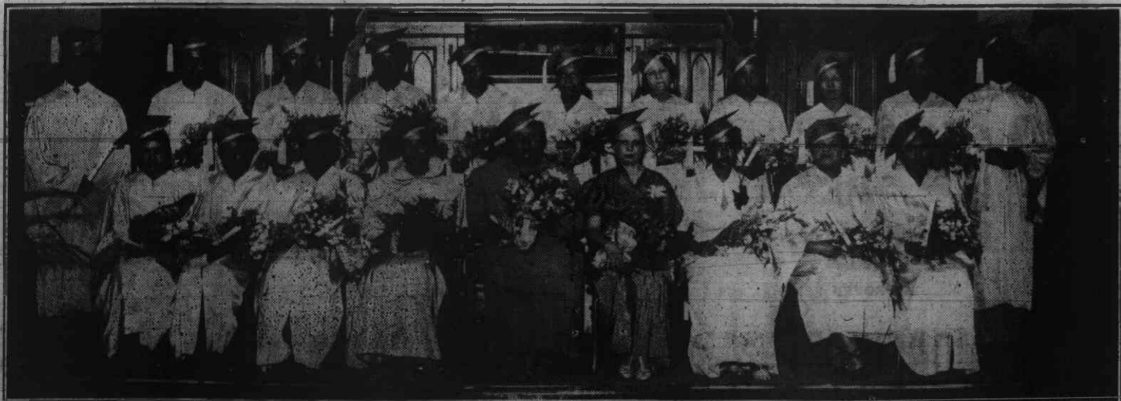
DASHAZOR'S BEAUTY SYSTEM GRADUATES HOLD EXERCISES AT ST. JOSEPH CHURCH

Members of the graduating class of beauty culture of the Dashazor Beauty System closed the year's work with commencement exercises at St. Joseph AME Church, Friday night, May 18th.