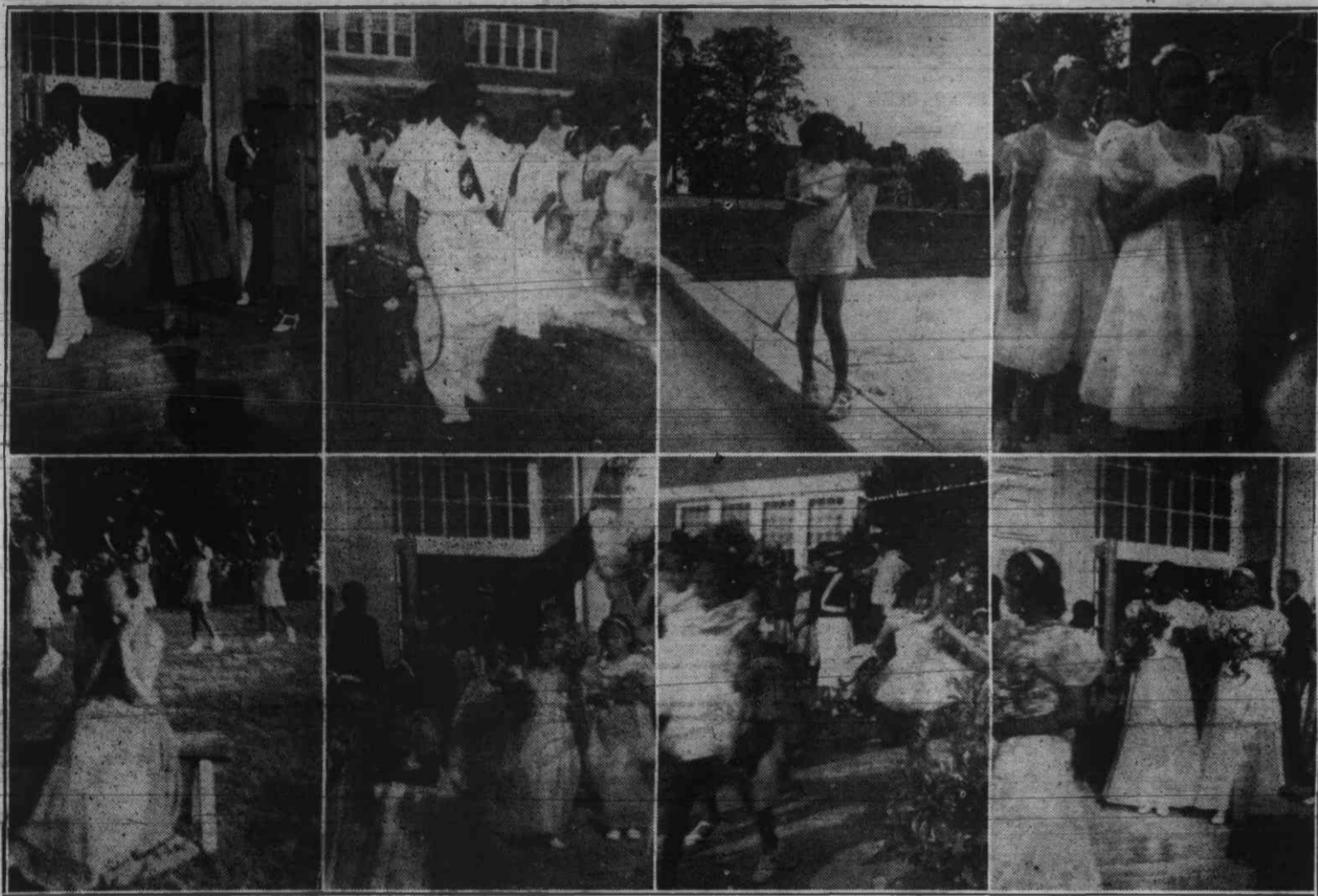
SCENES FROM MAY DAY EXERCISES AT PEARSON SCHOOL