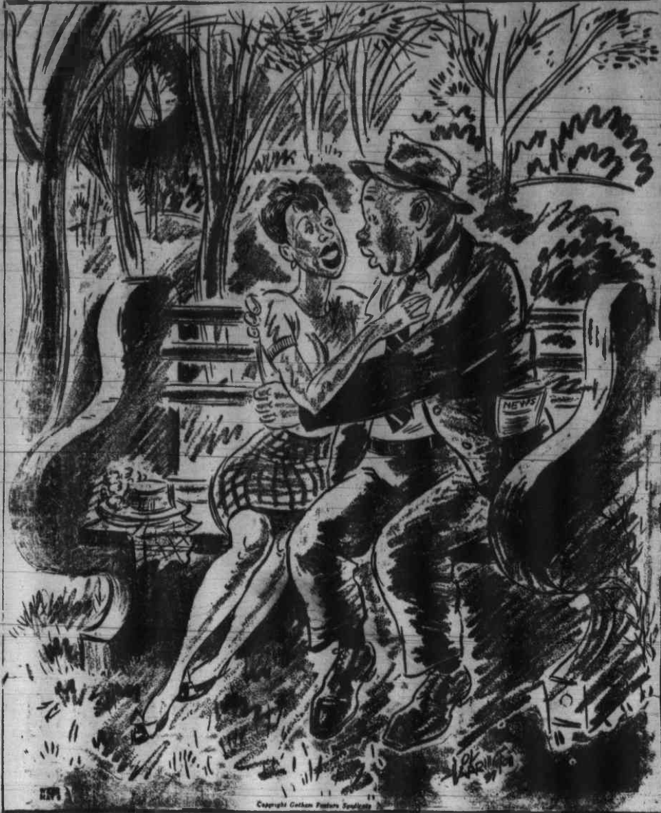
NOW WAIT JUST A MINUTE, BOOTSIE—DID YOU SAY YOU HAD A THOUSAND BUCKS OR YOU WISHED YOU HAD A THOUSAND BUCKS?