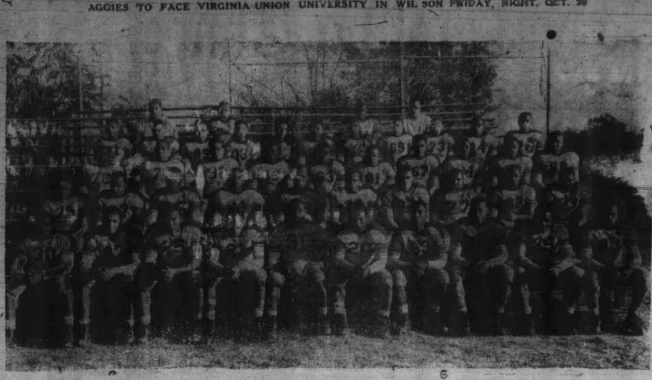
SHOWN ABOVE IS THE MIGHTY A and T AGGIES juggernaut which will face Virginia Union University at Wilson, N. C., Friday night Oct. 20. The Aggies are unbeaten and unscored upon in three games including a contest with Florida A and M College, last year's national champions.