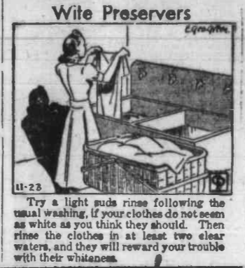
Try a light suds rinse following the usual washing, if your clothes do not seem as white as you think they should. Then rinse the clothes in at least two clear waters, and they will reward your trouble with their whiteness.

ONLY SUBURBAN dwellers are aware how much 60 feet of lawn between them and their neighbors improve their sociability.