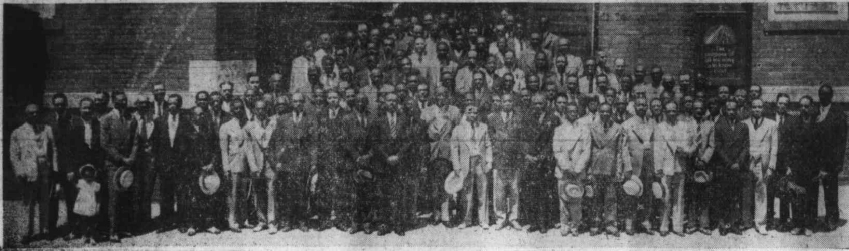
Possibly the largest number of men to attend Sunday School at one time at St. Joseph A. M. E. Church was when the Moore Bible Class of White Rock visited the Berean Sunday School Class. The picture shows the two classes immediately after they had left the church.