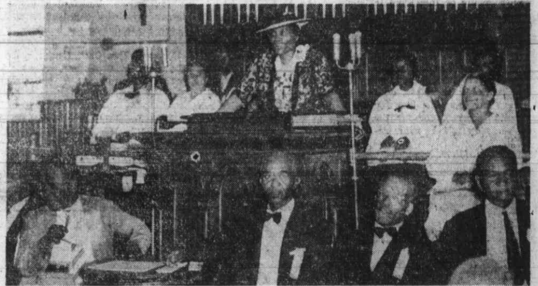
The North Carolina Ushers Association, which was held in Raleigh was the largest in the history of the convention. Sunday's meeting climaxed the entire session with an address delivered by Dr. Charlotte Hawkins Brown, shown delivering the principal address in the afternoon. More than 1,500 ushers were in attendance at last year's session.